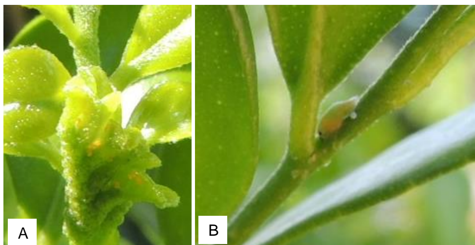
Figure 1. Diaphorina citri (Hemiptera: Liviidae) eggs (A), nymph (B), and adult (C) on shoots of the orange jasmine ( Murraya paniculata ) plants at Research Experimental Station of Incaper in Linhares, Espírito Santo state, Brazil. Detail of the parasitized nymphs by Tamarixia radiata (Hymenoptera: Eulophidae) (D). March 2015.

Adults, nymphs and eggs of Diaphorina citri were collected in seven different places in the Espírito Santo state (Figure 1). In the Northern, it was found in the Research Experimental Station of Incaper (19°25'01.5"S 40°04'44.8"W), and Santa Luzia Farm in the municipality of Linhares (19°33'30.6"S 40°10'40.0"W); Research Experimental Station of Incaper (Instituto Capixaba de Pesquisa, Assistência Técnica e Extensão Rural) in Sooretama (19°07'14.8"S 40°05'01.5"W), Marilândia (19°24'20.4"S 40°32'30.2"W), and Cachoeiro do Itapemirim (20°45'12.0"S 41°17'25.6"W). In Southern D. citri was found in the municipalities of Ibatiba (20°12'49.23"S 41°29'44.07"W) and Guaçuí (20°47'8.68"S 41°49'24.23"W) (Figure 2). Samples were collected in the canopies of citrus ( Citrus sinensis ), and orange jasmine ( Murraya paniculata ), and associated with shoots and leaves. All the samples were infested with D. citri . Nymphs of D. citri were placed in plastic pots with fresh shoots of M. paniculata to observe parasitoid emergence (Figure 1), which about 50% of the nymphs had parasitoid emergence. Parasitoids emerged were preserved on 70% alcohol and then send to species identification by Dr. Valmir Antonio Costa from the Biological Institute of the Department of Agriculture and Supply of the São Paulo State.